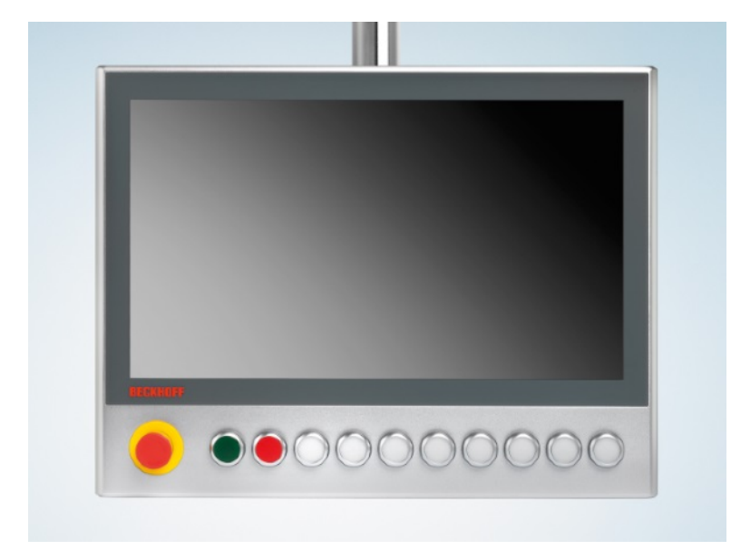
Fig. 5: Panel example

For two Panels the PLC program looks like this: