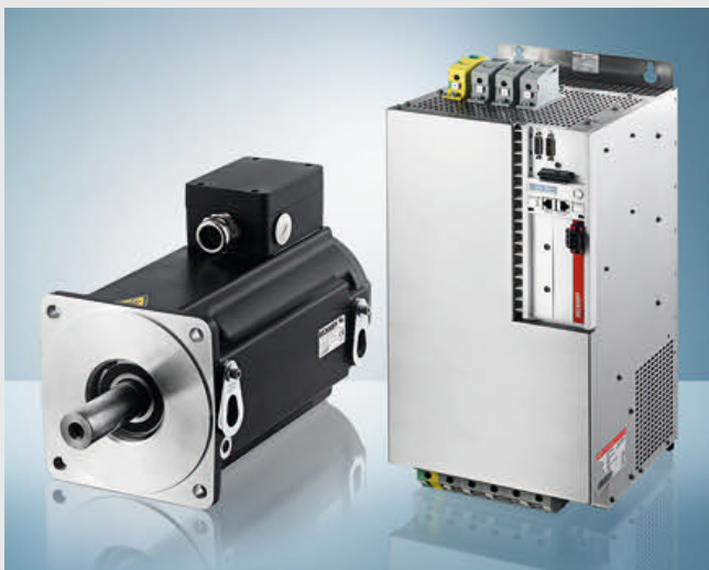
The portfolio comprises a wide range of performance components for servo drives. They suit the various requirements of plastics machines in an optimum way and comply with the demands of energy efficiency