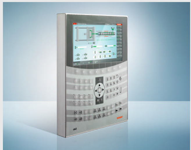
Tailor-made solutions are offered complete with software and hardware which help users master the control of complex injection molding processes. The proven technology software includes standard functionalities for injection molding machines, such as the precise and highly repeatable control of speed, pressure and temperature

■ What are the current hot topics in plastics machine engineering?