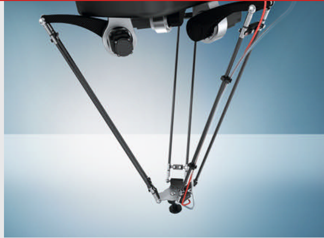
The TwinCAT software integrates a robot control system seamlessly into the standard control technology

up to 170 A. Highly productive manufacturing cells require rapid handling systems, e.g. for in-mold labeling. TwinCAT is able to offer practical solutions for this with its powerful NC functions. This results in less expensive, more compact and, above all, more flexible machines.