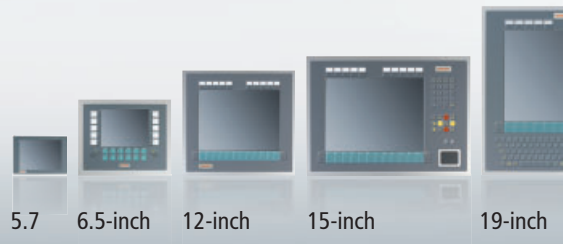
5.7 6.5-inch 12-inch 15-inch 19-inch