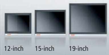
12-inch 15-inch 19-inch