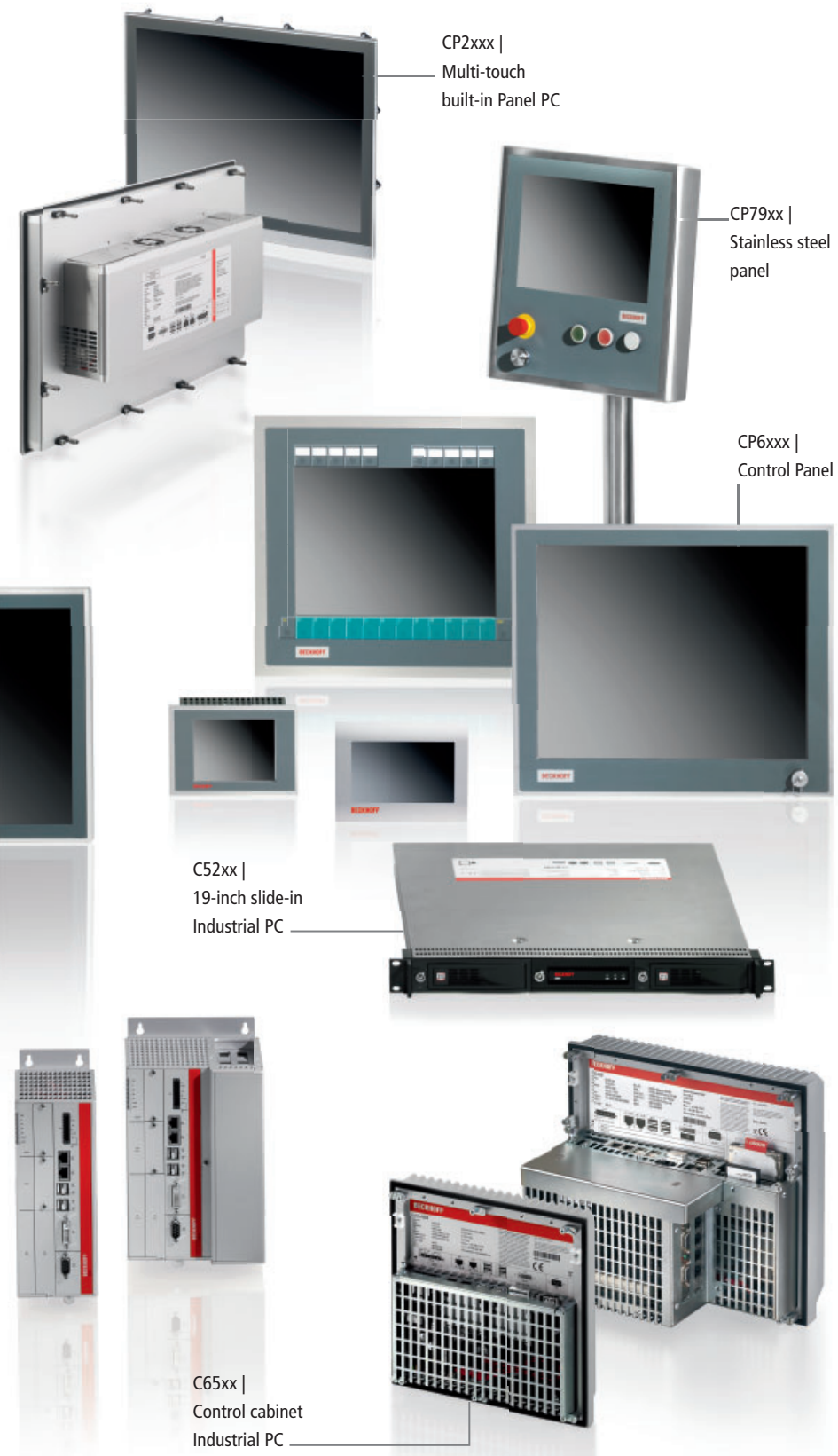
CP2xxx | Multi-touch built-in Panel PC