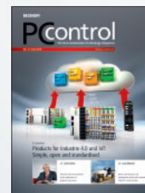
PC control magazine (additionally as App)