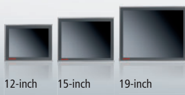
12-inch 15-inch 19-inch