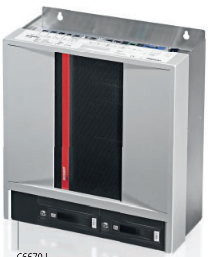
C6670 | Control cabinet industrial server